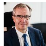
Pentti Hakkarainen Member of the Supervisory Board, European Central Bank